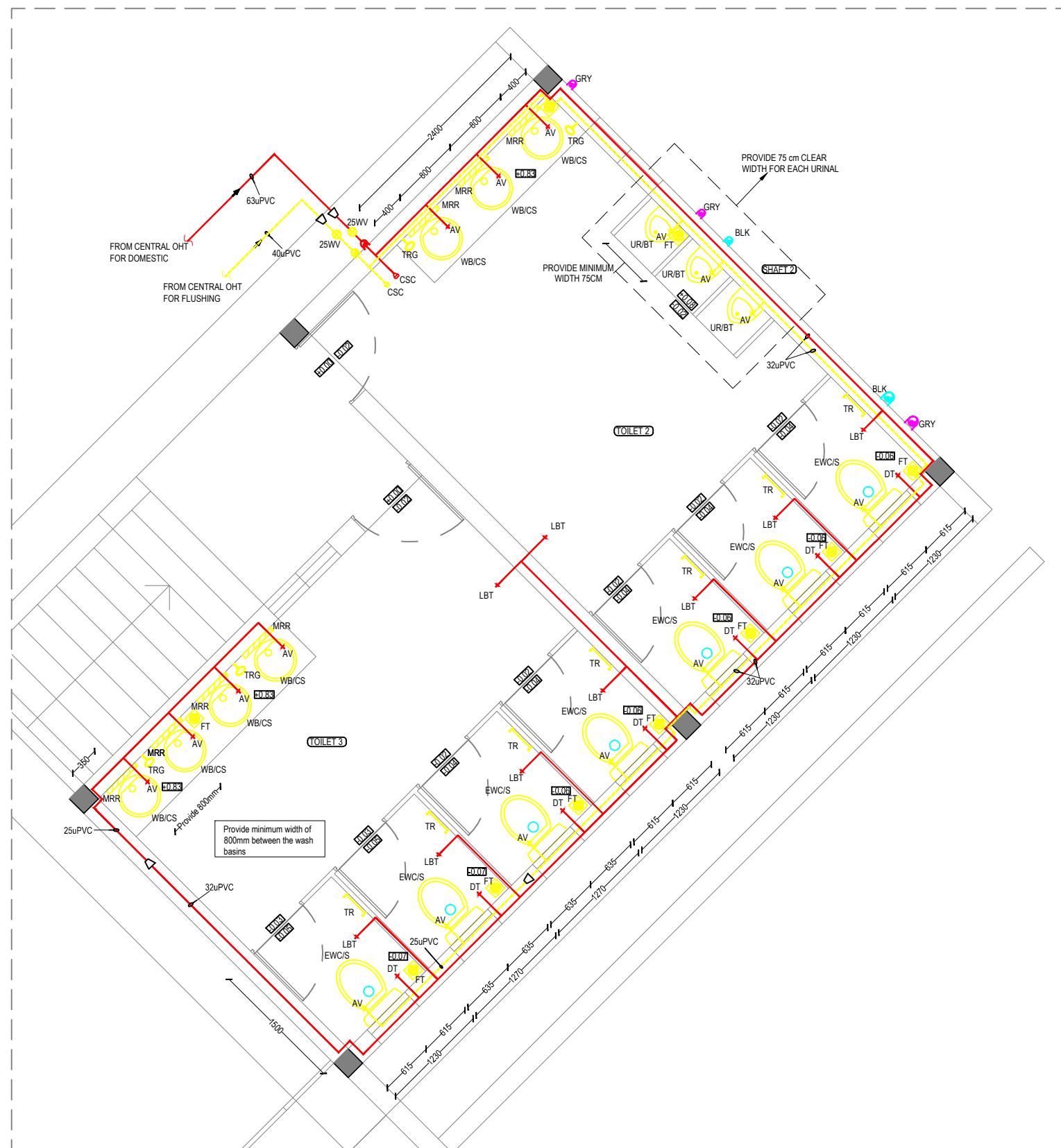
PLUMBING LAYOUT SHOWING WATER SUPPLY LINES IN TOILET 1&2 SCALE 1:30